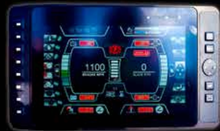
10" Modern Digital Control Touchscreen

Dozer blade for pushing debris out of the work area