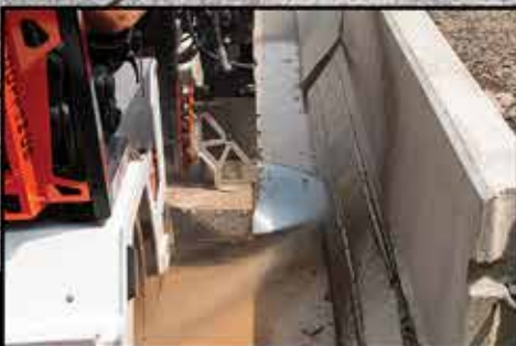
54" Horizontal Cutting Capacity